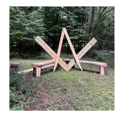
More photos from the Master Mason outdoor degree on August 27, 2022