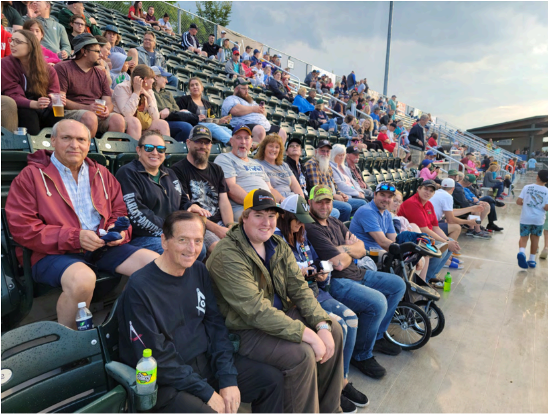
Brothers enjoying a Woodchucks baseball game